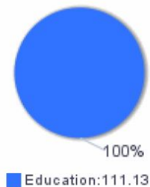
Table1: MSYs by Focus Areas